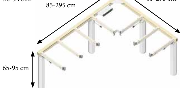
FlexiPlus Corner , 90° up to 160° corner angle