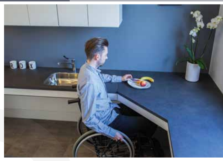
Ropox FlexiElectric and FlexiCorner solution.