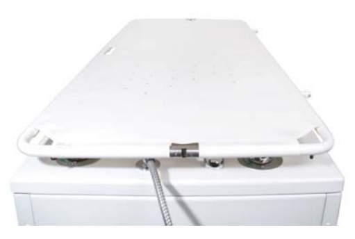
Rio bath shown with Neatfold stretcher and low profile taps