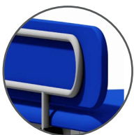
Padded Side Supports