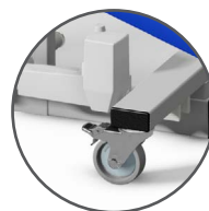
Large Castor Base