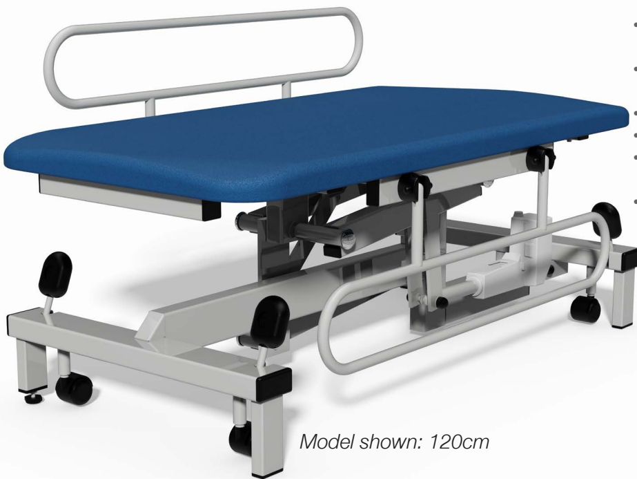
Model shown: 120cm